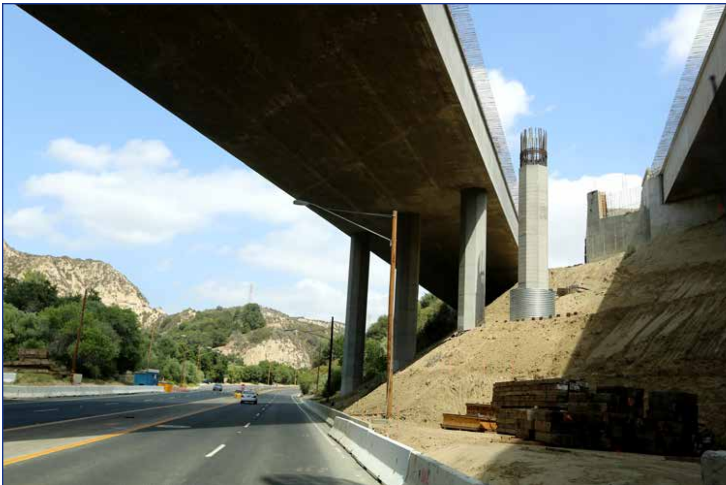
Existing bridges in the Newhall Pass are being widened to accommodate new truck lane project between Lyons Avenue and State Route 14.